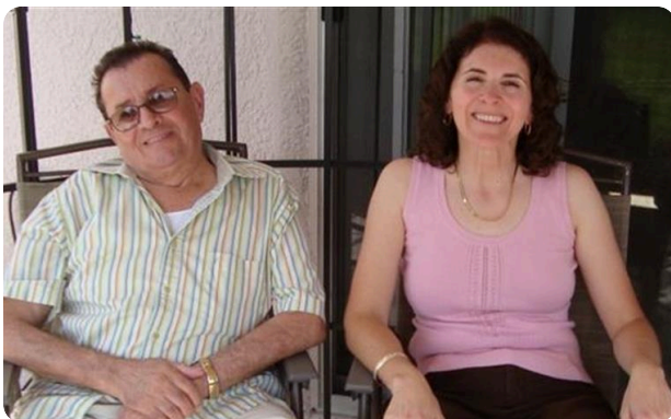
Dad & me during Easter